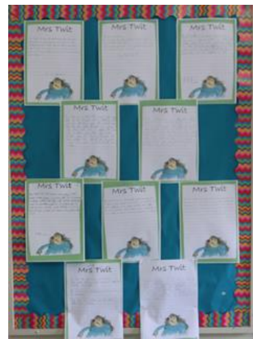
4R Foyer display